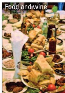
Food and wine