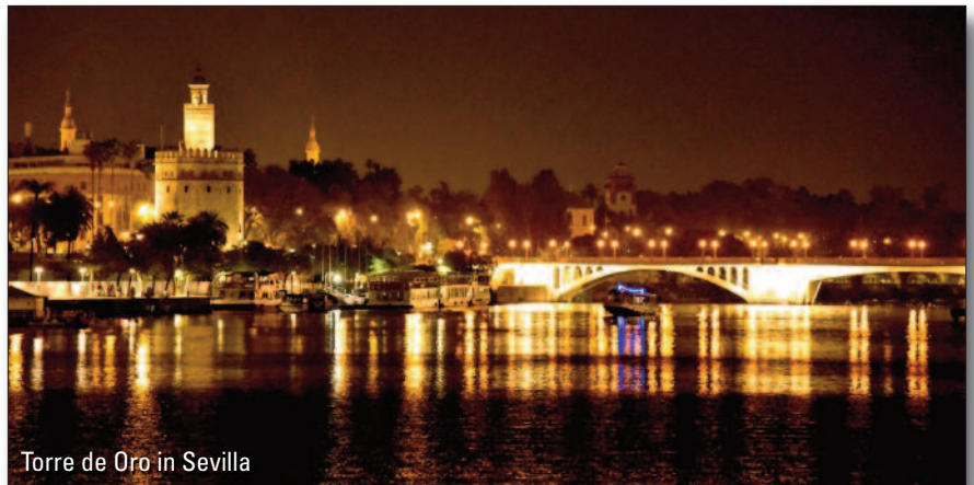
Torre de Oro in Sevilla