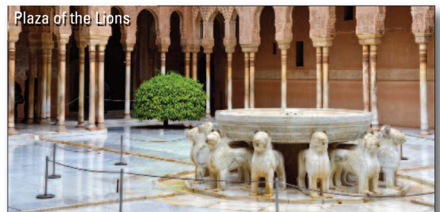
Plaza of the Lions