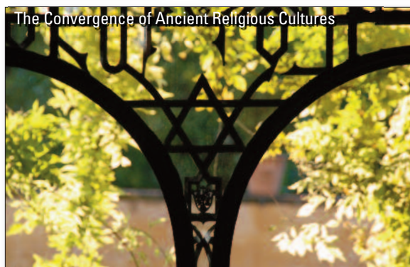
The Convergence of Ancient Religious Cultures