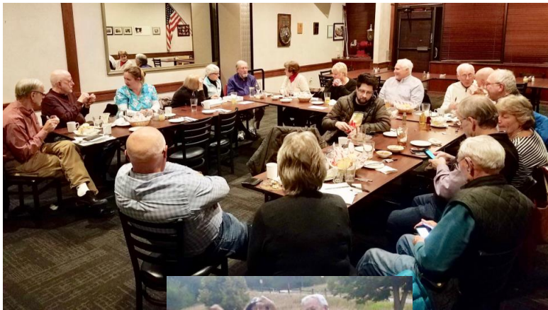
Monday Night Pub