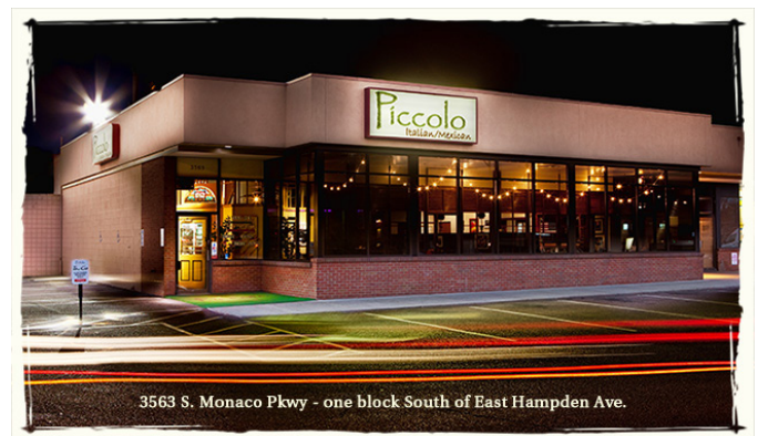
3563 S. Monaco Pkwy - one block South of East Hampden Ave.

Anticipated cost: Food/drink at the restaurant. Piccolo's does not charge us for the room, so please support the restaurant and the wait staff as you are able.