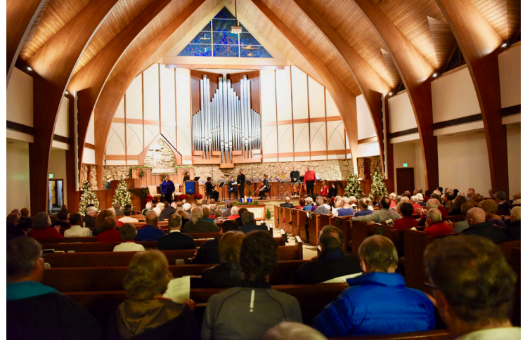
A full house!