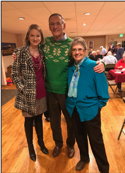
The Caritas Class & Friends recently fellowshiped at their Christmas Party.

One of the best ways to connect at Calvary is to join a church school class or small group. Calvary offers lots of small group options, from church school on Sunday mornings to casual Monday Night Pub. To view more, simply go to the Church School classes page under the Learn tab on our website ( www.calvarydenver.org ), or grab a church brochure off of the Welcome Kiosk in the Narthex.