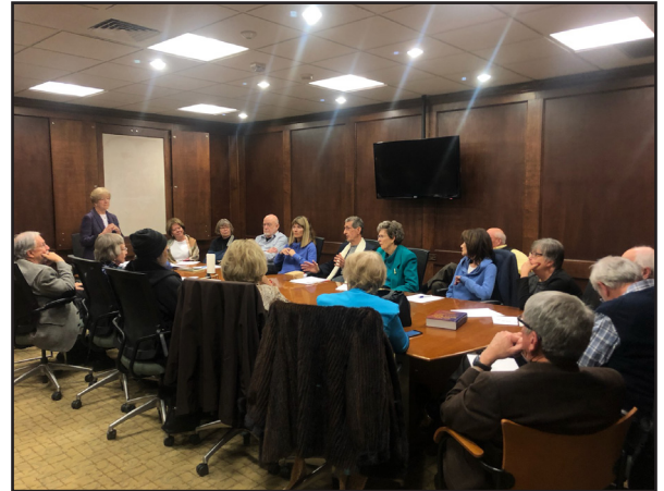
Pictured here are B&B volunteers at a training meeting.