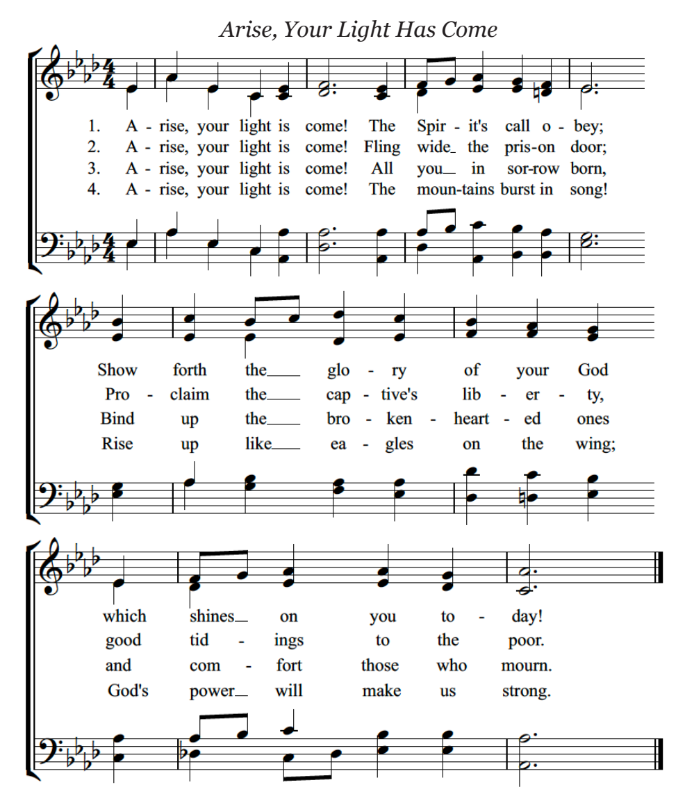
Text adapt. R. Duck. Music: W. Walter. One License #A-723084/Song #07293