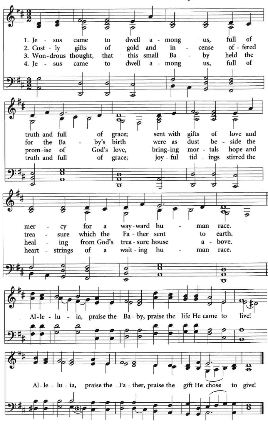
Text: B. Luttrell. Music: B. Harlan. One License #723084/Song #60147