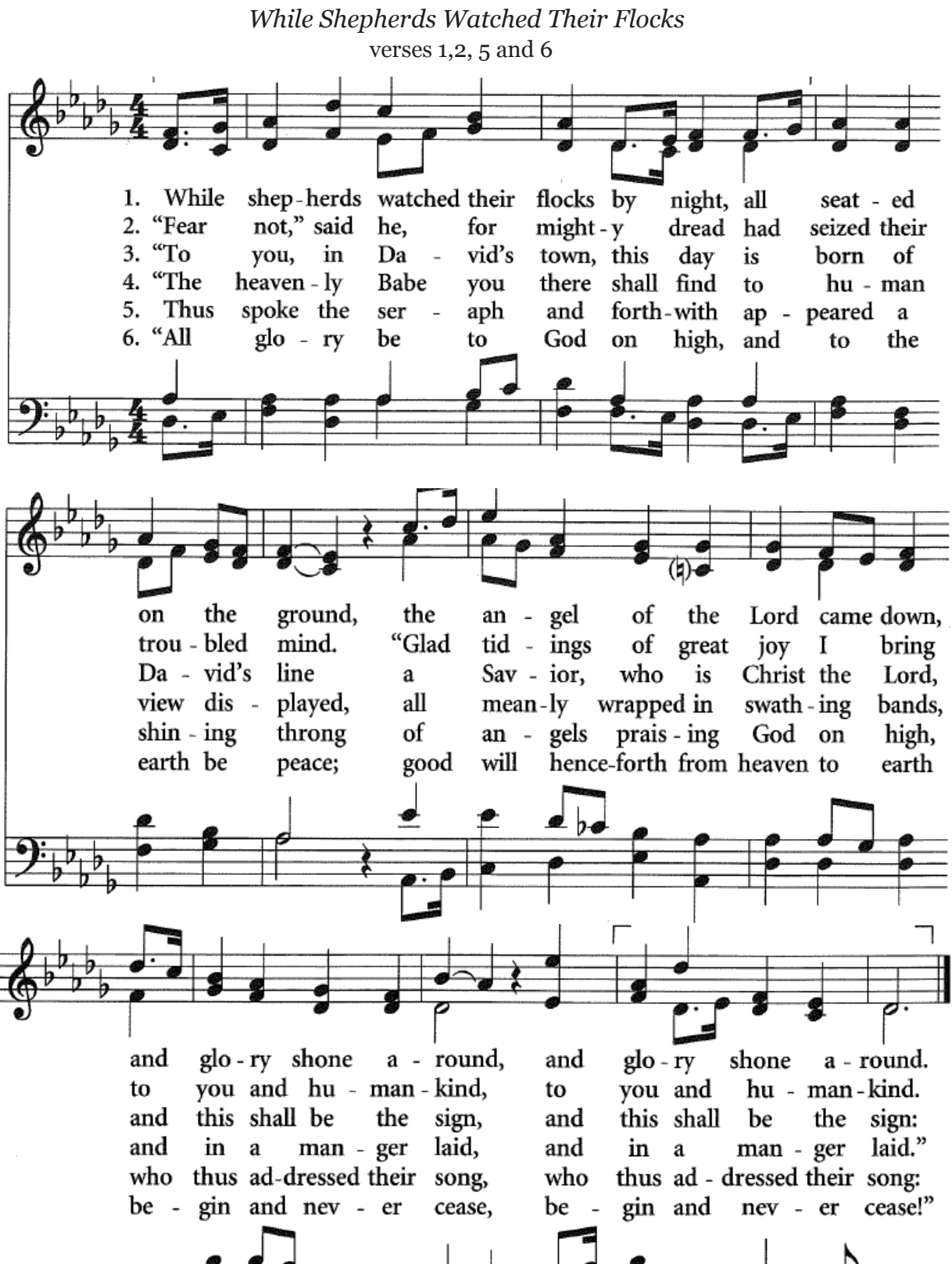
Text: N. Tate. Music: Harmonia Sacra. Public Domain.