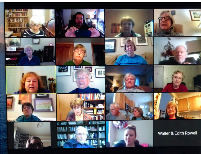
Calvary Choir has a biweekly Zoom call.