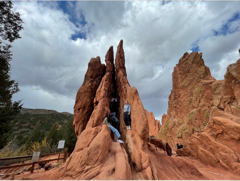
Photo Recap from Oct. 23 - Garden of the Gods