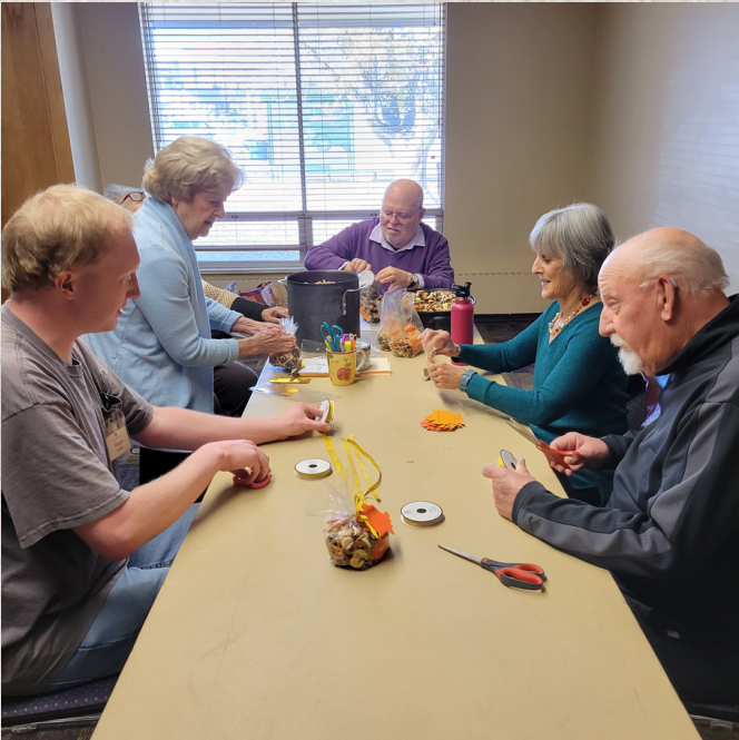
prepping VIP gift bags