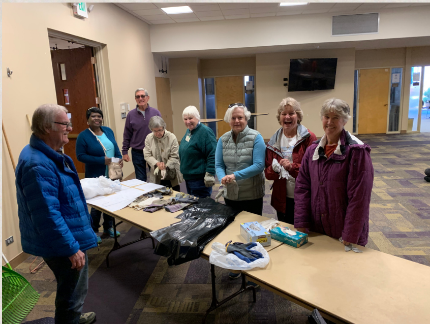
Getting prepped for trash collection